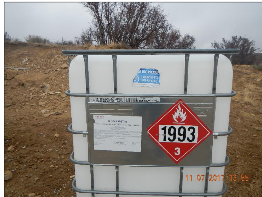
Unused chemical empty container next to separators.