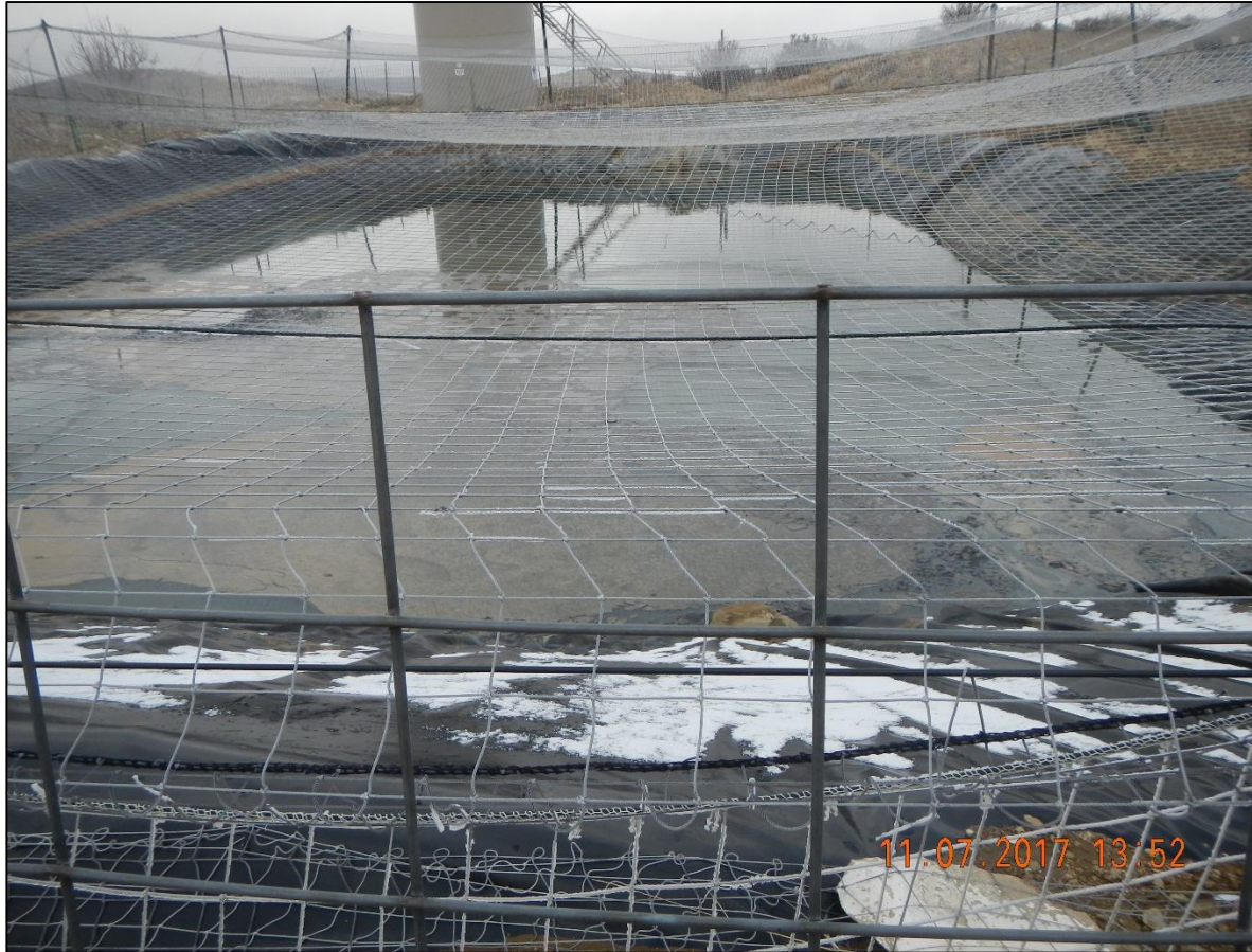
Hydrocarbons observed on pit

TR 11-17-597 pad Api # 05-045-14224 Inspection # 689700584