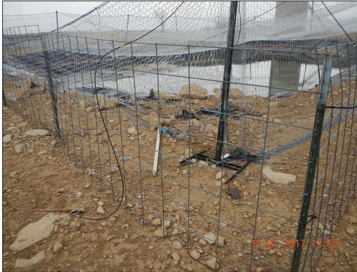
Gap in netting at south east corner of pit.

TR 11-17-597 pad Api # 05-045-14224 Inspection # 689700584