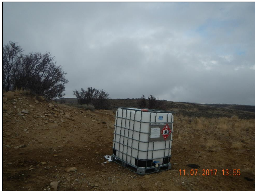
Unused chemical empty container next to separators.

TR 11-17-597 pad Api # 05-045-14224 Inspection # 689700584