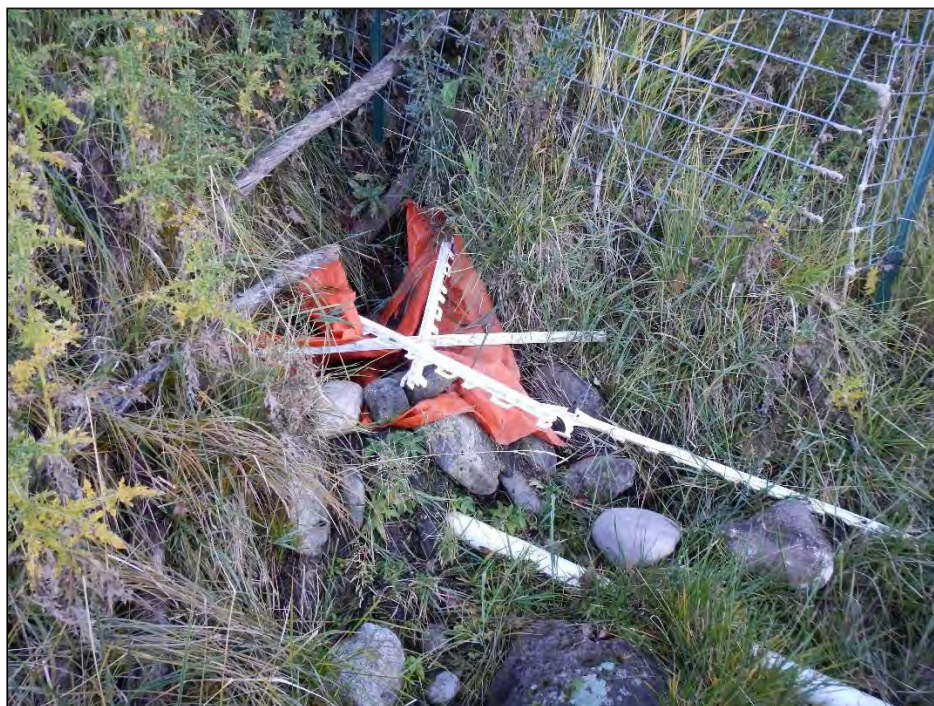
Photograph 1: North Flatiron Spring emanation point