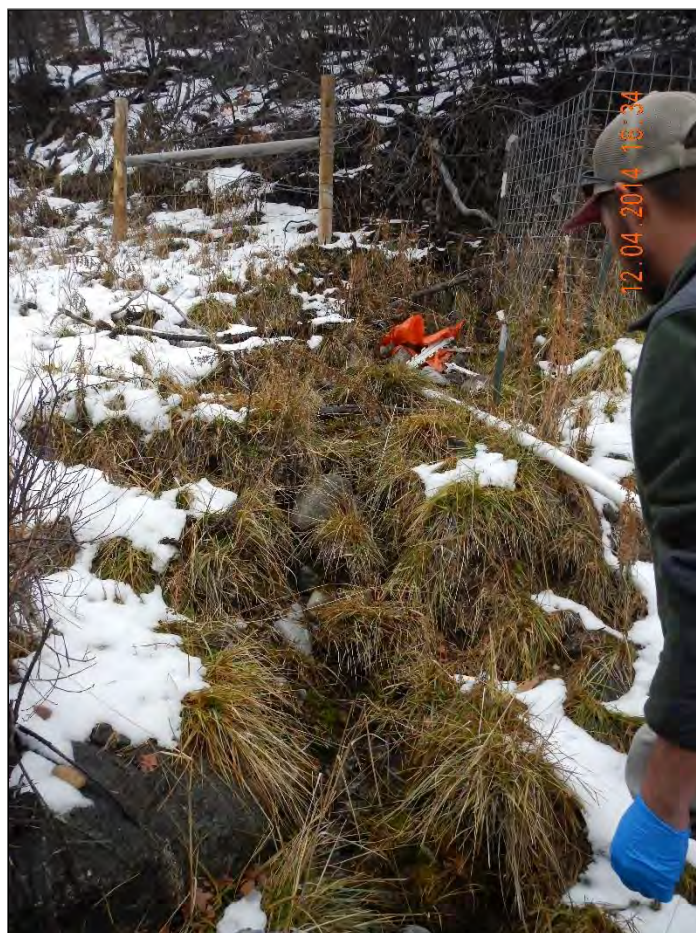
Photograph 2: Saturated drainage from North Flatiron Spring