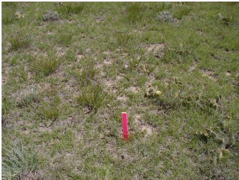
Looking at Ground