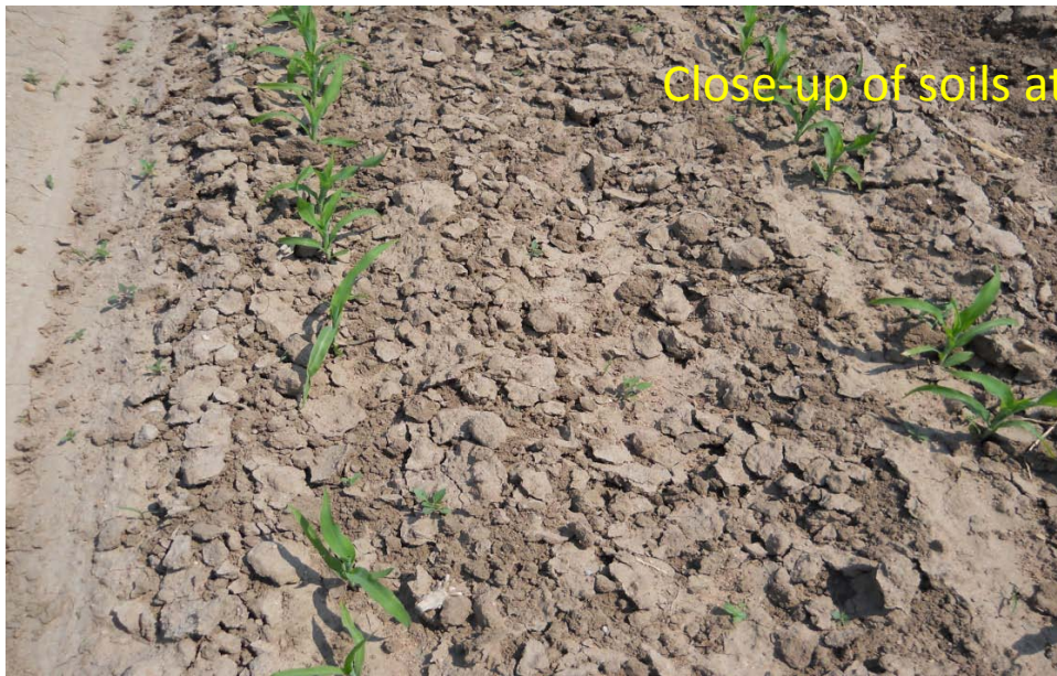
Close-up of soils at the former wellsite