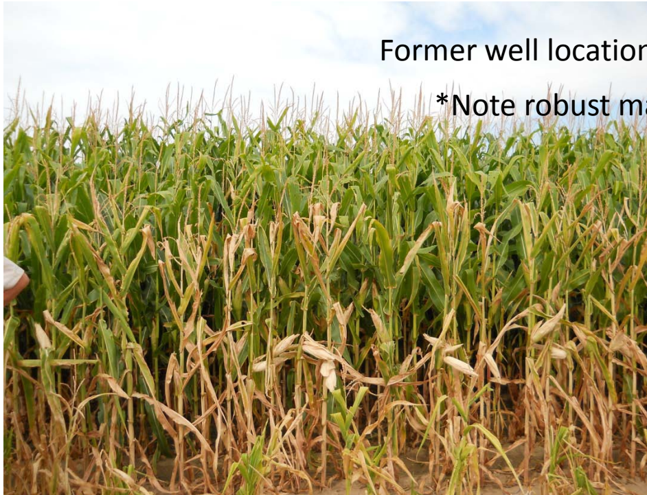
Former well location – September 1, 2011