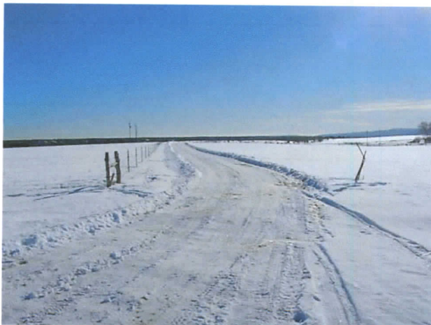
Access at Well Location