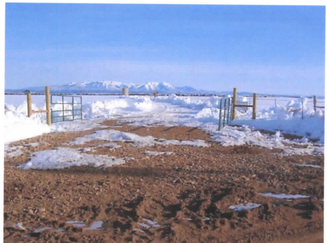
Access at Road