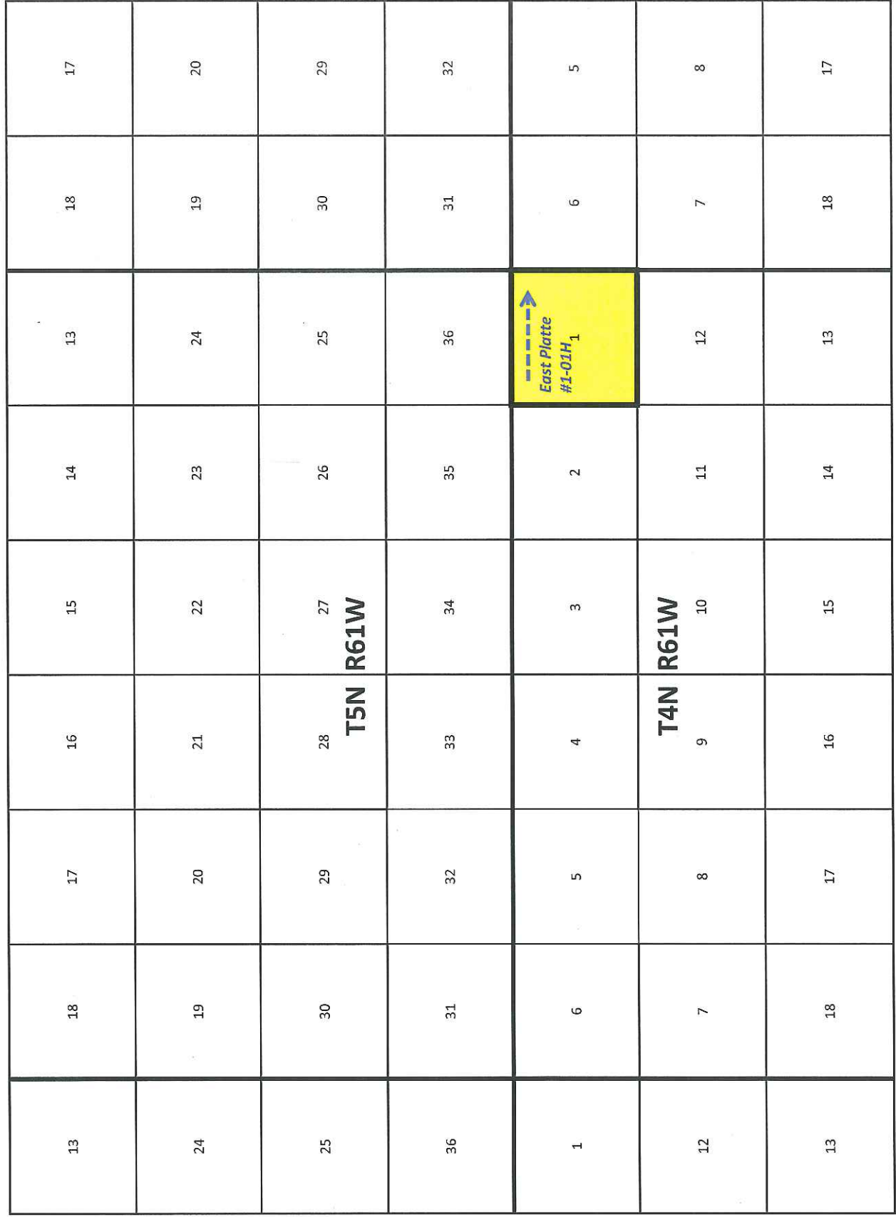
Exhibit A Application Map